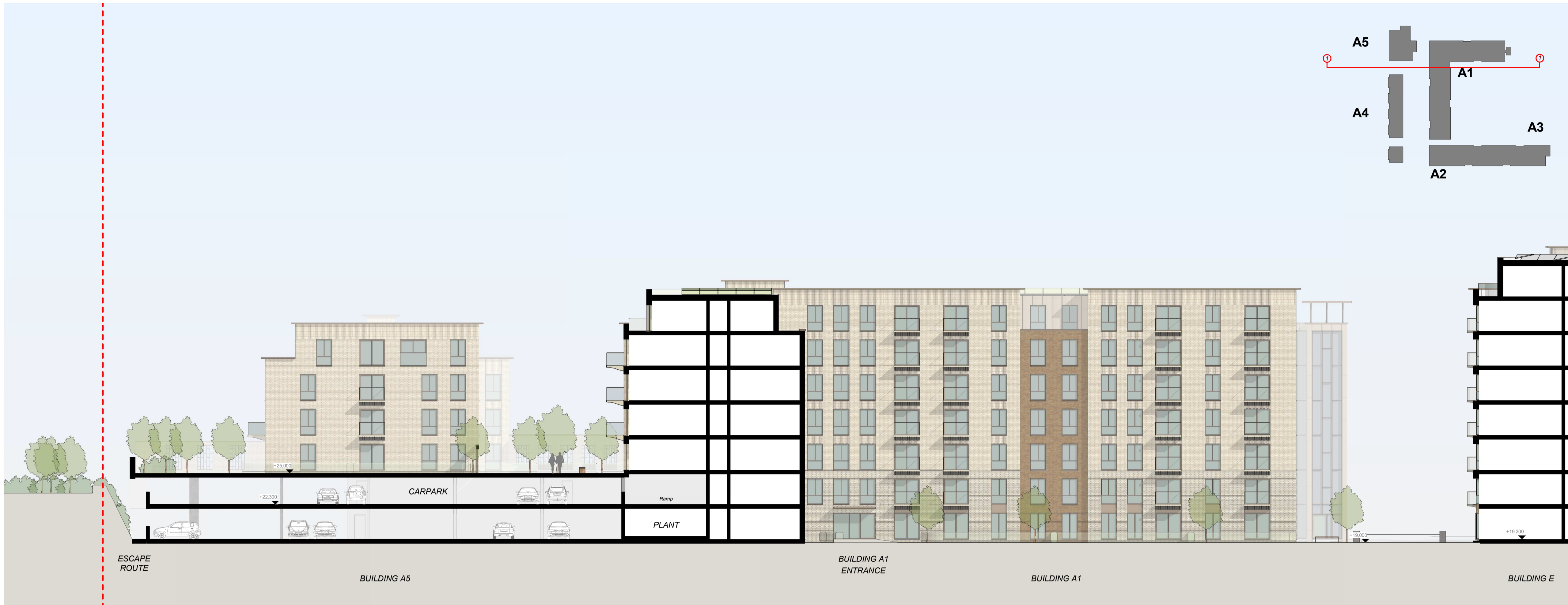
1 A1 and A5 Internal Elevation 1:200