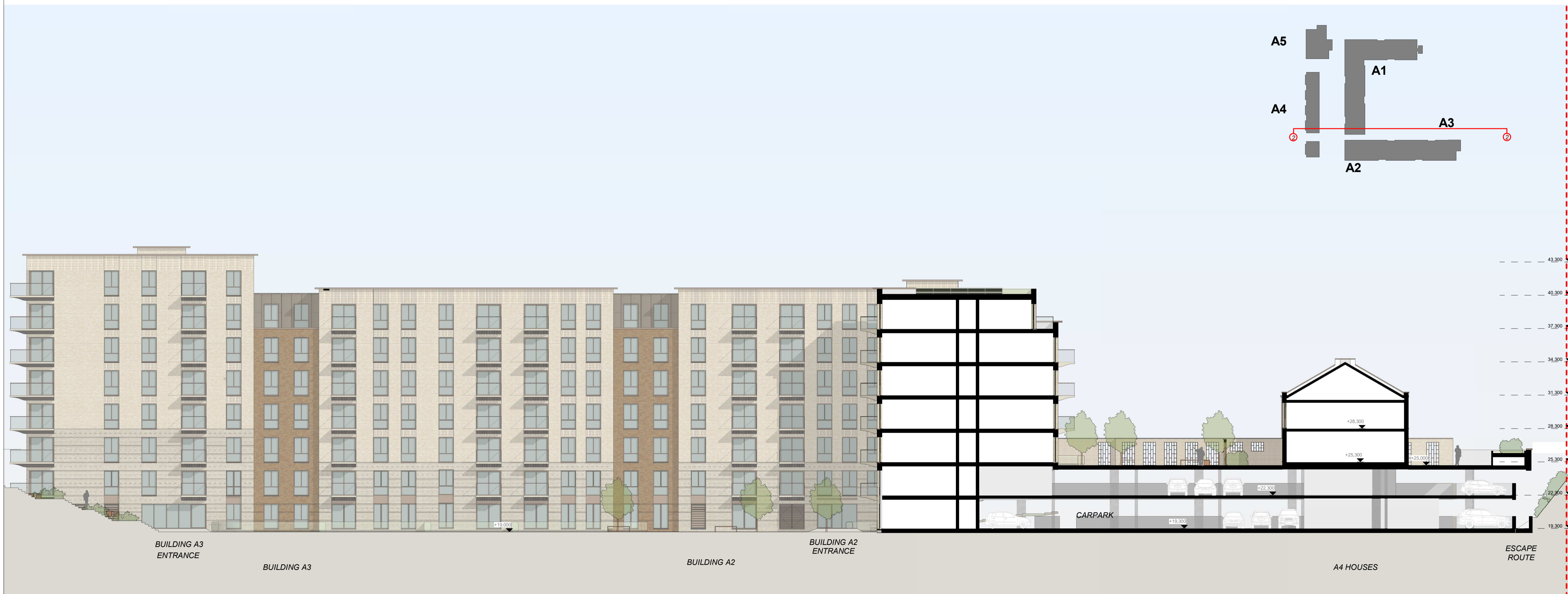
2 A4 Internal Elevation 1:200

Rev: P02 Date: 09.09.2020 Drw: KW Chk: SG Minor Amendments; Landscape/Car Park Changes Rev: P01 Date: 13.09.2019 Drw: FD Chk: SG Planning Issue